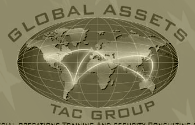
SPECIAL OPERATIONS TRAINING AND SECURITY CONSULTING GROUP

The 21st century has brought with it a wide range of security challenges. From the war against international terrorism on all its fronts to the constant fight against the ever-evolving criminal element of our society, now more than ever we find ourselves struggling to find appropriate solutions without compromising our way of life. Fortunately there are those in the international community who possess the necessary knowledge and skills to help us meet these challenges.