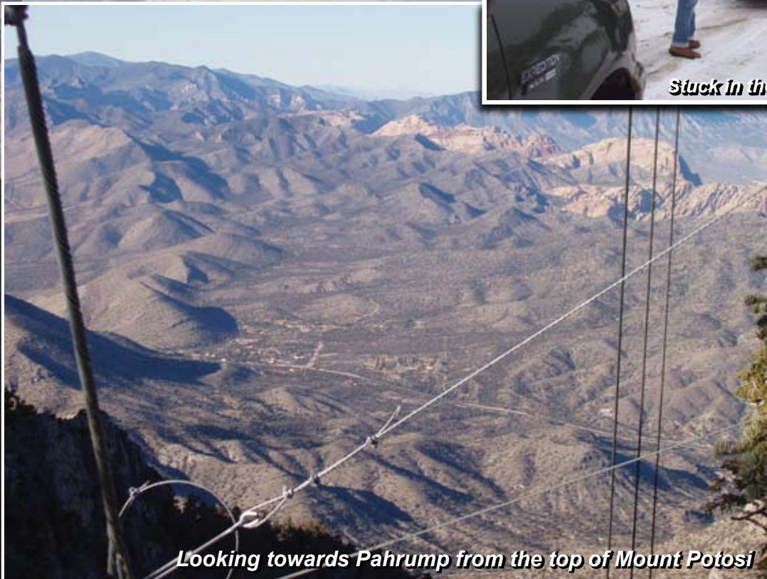
Looking towards Pahrump from the top of Mount Potosi