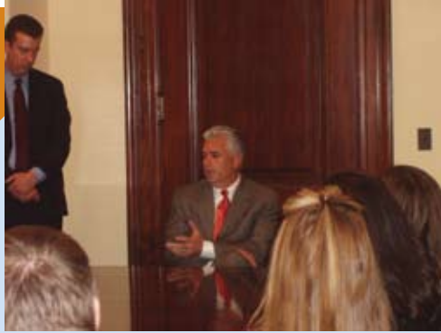
Senator Ensign asked detailed questions.