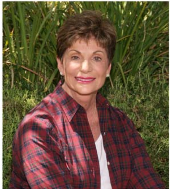
Your Favorite Congresswoman Shelley Berkley

Congratulations to the Nevada Broadcasters Association for another year of outstanding service to our community.