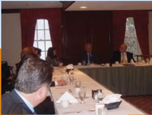
Breakfast with Jim Gibbons at The Capitol Hill Club