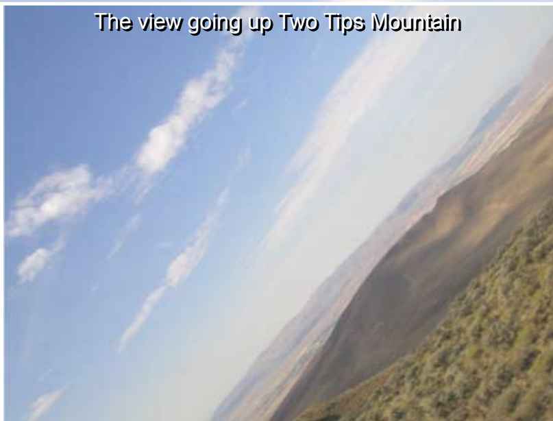
The view going up Two Tips Mountain