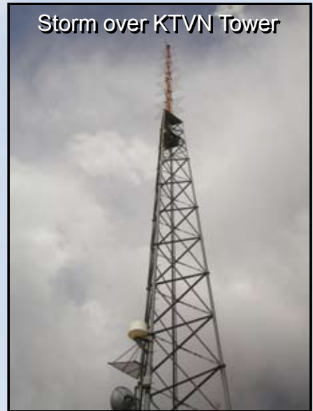
Storm over KTVN Tower